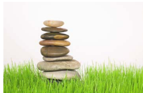
Summertime at "THE CARRIAGES"